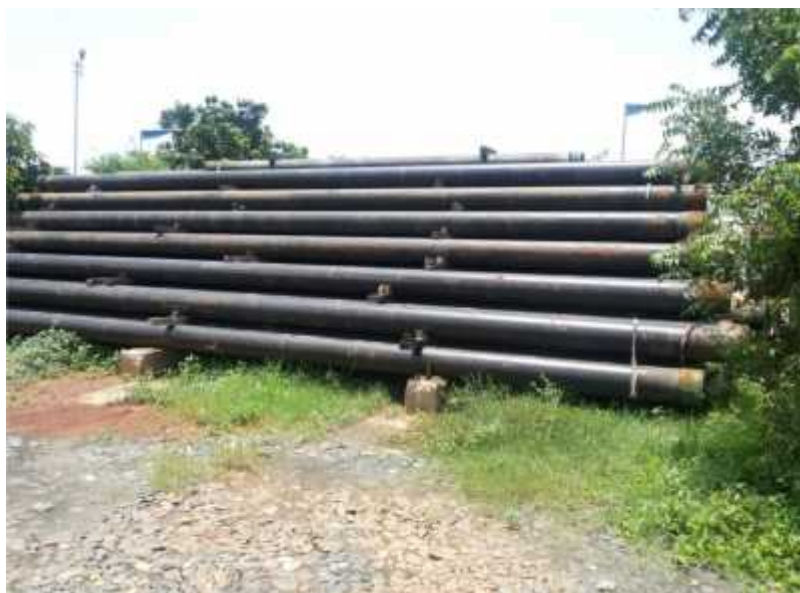
Stacking on RCC Beams placed on Foundation (with stoppers at both ends of each row)