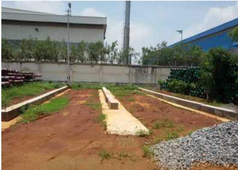
A sample photo of Foundation * Precast Blocks/Beams (No Steel Pipe rack)