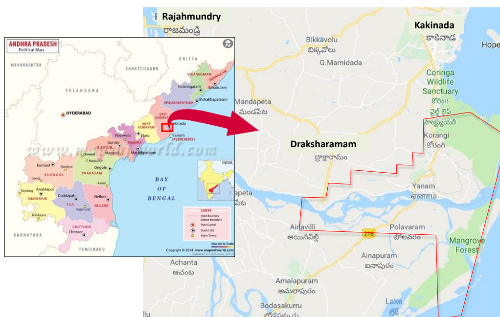
Figure-1a: The location of the Block KG-ONN-2004/1 in KG basin

The Block KG-ONN-2004/1 of 549 SqKm area has been awarded by the Ministry of Petroleum & Natural Gas (MOP&NG), Govt. of India, under its New Exploration Licensing Policy (NELP) round VI, to the consortium of Oil India Limited (OIL), A Govt. of India Enterprise (with 90% stake as the Operator) & GeoGlobal Resources (GGR: Barbados) with 10% stake as the partner for the Block, for carrying out extensive & expeditious exploration for Petroleum & Natural Gas in the region. This 549 SqKm comprises of 511 Sq Km on land area in the district of East Godavari, Andhra Pradesh (AP) and that of 38 Sq.Kms. in the district of Yanam, Puducherry (UT). However, due to non-availability of Government / Statutory permission in some parts of area falling under Forest, Coringa Wildlife Sanctuary, CRZ area including other surface facilities like installation of Pipeline, the total block area was reduced to 353 Sq.Km (present exploration area).