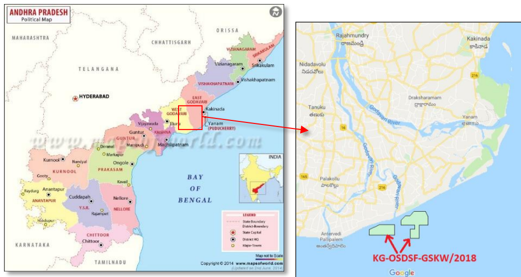
Figure-1: The location of the Block KG/OSDSF/GSKW/2018 in KG basin

The Block KG/OSDSF/GSKW/2018 of 93.902 Km 2 area is in two parts separated by a distance of around 1.75 km, with water depths ranging from 5 to 15 m. The eastern part of the block is having an area of 64.547 Km 2 , while the western part of the block is having an area of 29.355 Km 2 . The closest point of block boundary to the east coast is at around 650m, while the farthest point of the block boundary is at around 11.2 kms. The nearest village to the block is Kesanapalli in Malikipuram mandal of the East Godavari district, Andhra Pradesh (AP), India.