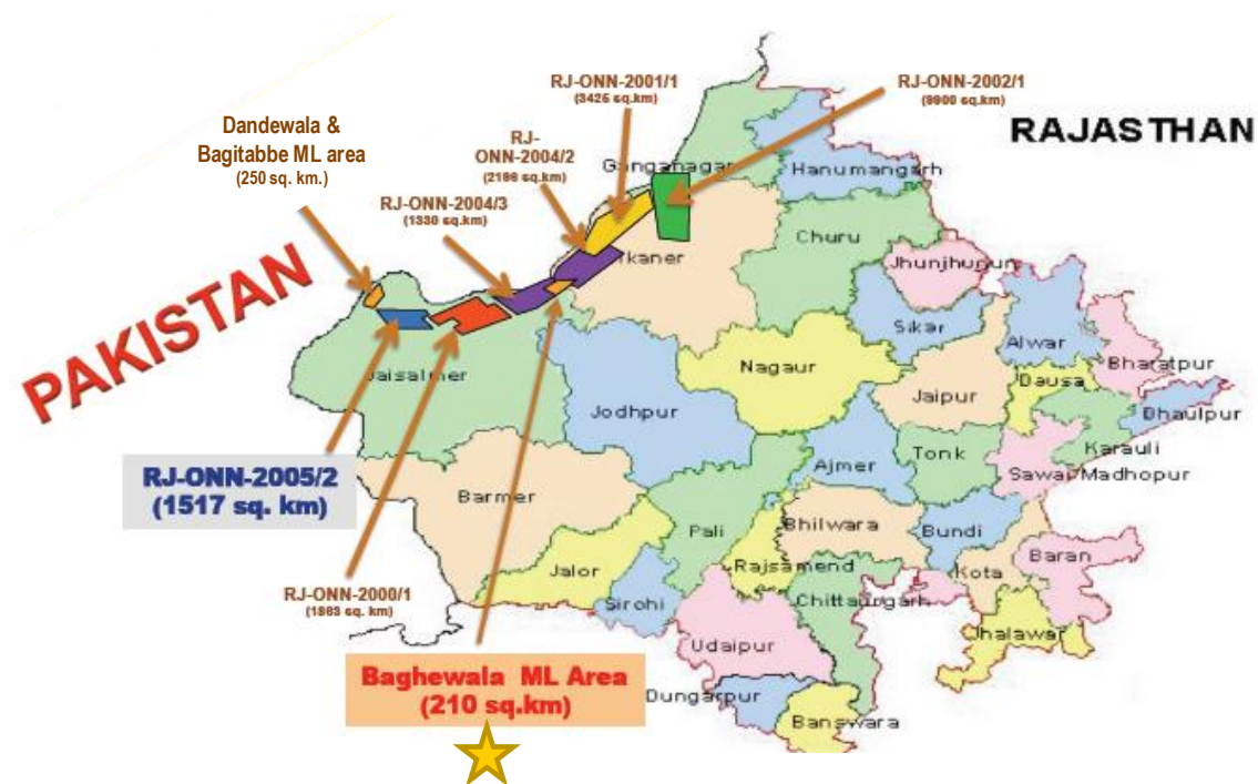
MAP of Baghewala STRUCTURE