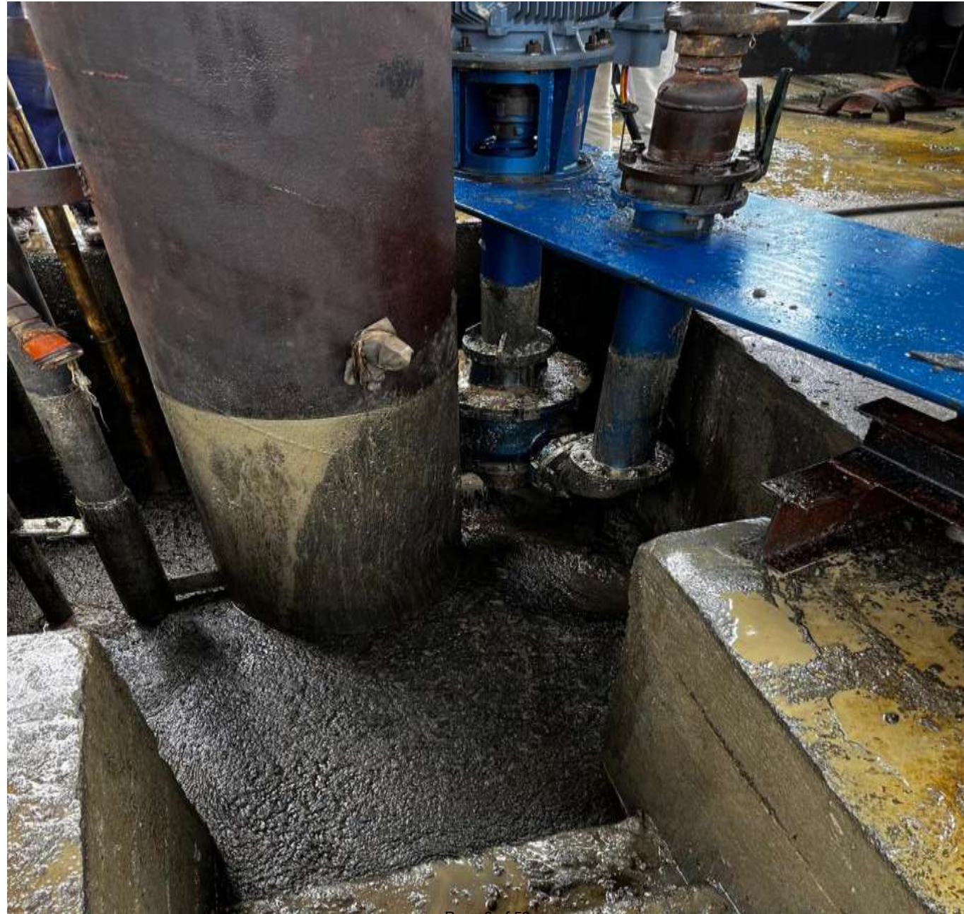
Image 2 of current arrangement of Vortex pump inside Cellar pit with False Conductor at center.