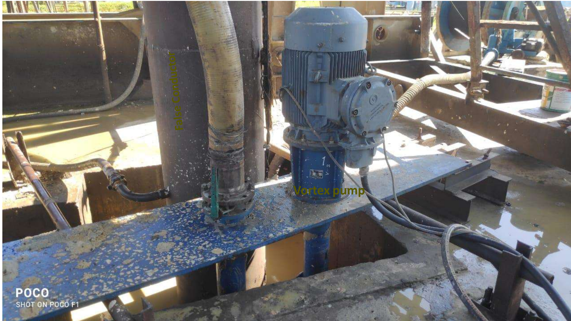
Image 1 of current arrangement of Vortex pump inside Cellar pit with False Conductor at center.